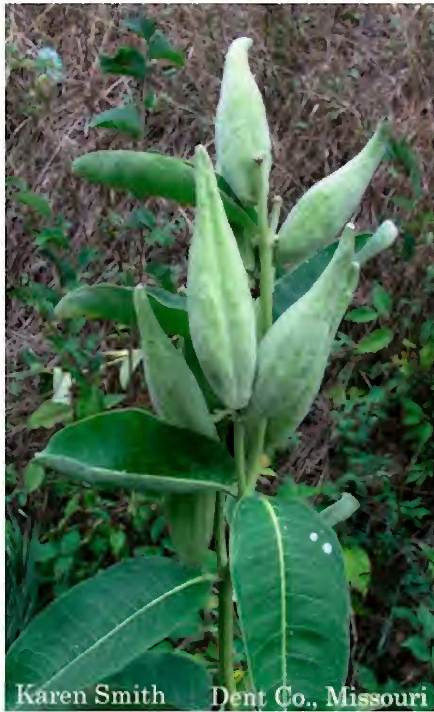
Figure 2. Asclepias syriaca x A. purpurascens . Hybrid with smooth fruits.